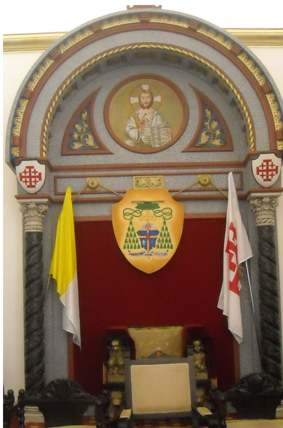
The Cathedra of Jerusalem